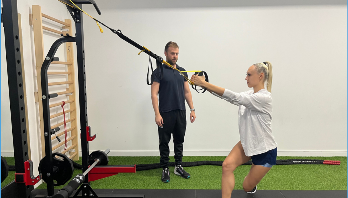
TRAINING AND FITNESS AREA

Private areas for personal training and weightlifting room