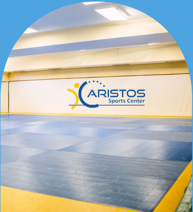
TATAMI 14*13M. Measures 182M2