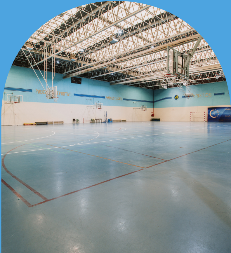
ANDRÉS CASADO SPORTS HALL

Private areas for personal training and weightlifting room